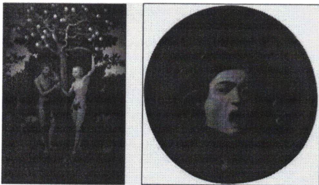
Figure 1. Depictions of snakes and spiders in art and media. Left, Adam and Eve , 1526, by Lucas Cranach the Elder. Retrieved from https://commons.wikimedia.org/wiki/File:Lucas_Cranach_d._%C3%84._001.jpg . In the public domain. Right, Medusa , 1597, by Caravaggio. Retrieved from https://commons.wikimedia.org/wiki/File:Medusa_by_Caravaggio.jpg . In the public domain. See the online article for the color version of this figure.

On first glance, developmental research appears to support evolutionary accounts of snake and spider fears, suggesting that infants have a predisposition to quickly fear these animals. For example, infants show more robust and faster associations between snakes and fearful voices than between snakes and happy voices. Seven- to 16-month-olds look longer at a dynamic snake video than a side-by-side video of another animal (elephant, giraffe, etc.) while listening to a central soundtrack of a fearful voice, but not a happy voice (DeLoache & LoBue, 2009); they do not show differential looking to videos of the other animals paired with fearful or happy voices. Similarly, 11-month-old girls—but not boys—associate photographs of snakes and spiders with fearful emotions, but they do not learn to associate images of flowers and